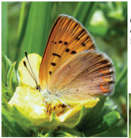
Clayton's Copper female ( L. dorcas claytoni ), Springfield, ME, 8/2/12, Barbara Volkle