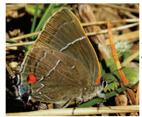
White M Hairstreak ( Parrhasius m-album ), Montague Sand Plains, MA, 4/13/12, Sue Cloutier