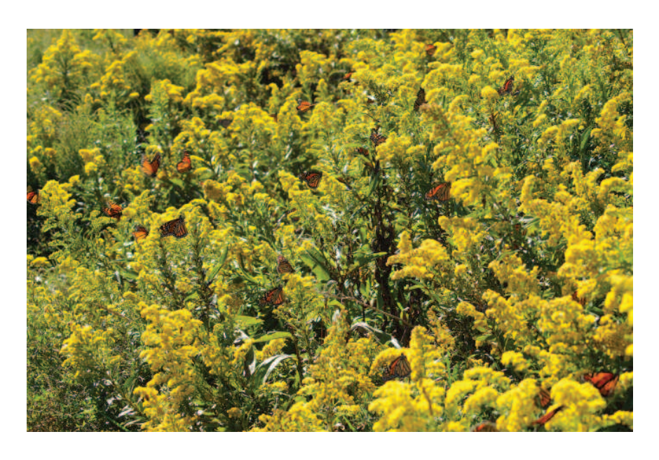
Migrating Monarchs ( Danaus plexippus ), Eastern Point, Gloucester, MA, 9/15/12, Dawn Puliafico