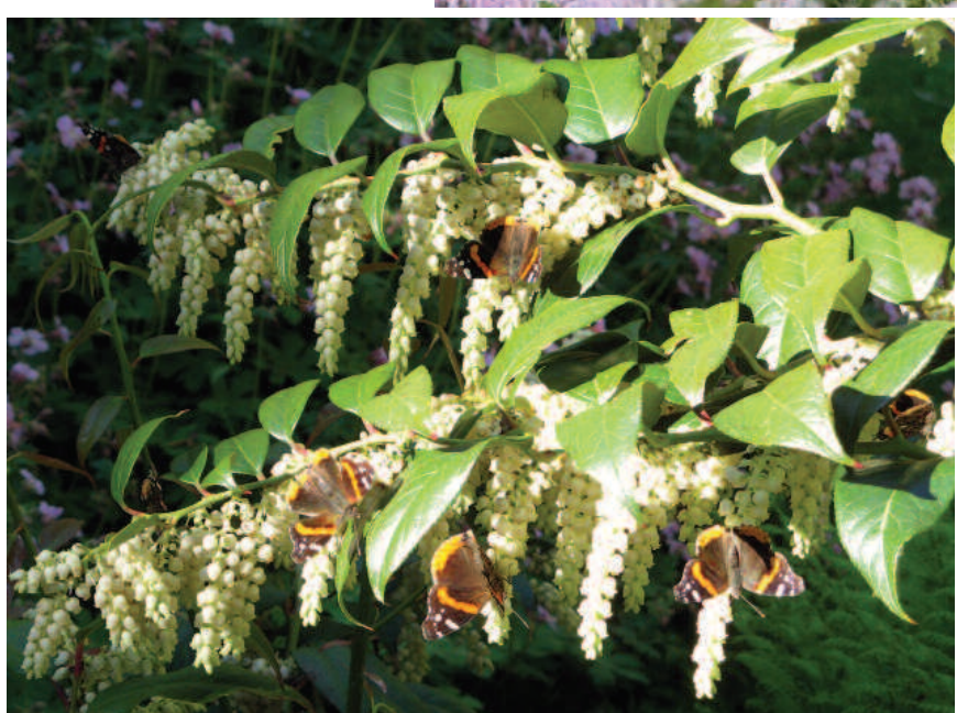
Red Admirals (Vanessa atalanta), Cambridge, MA, 5/12/12