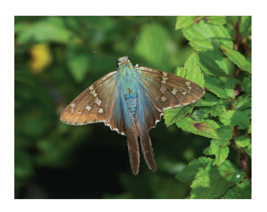
Spring 2013, No. 40