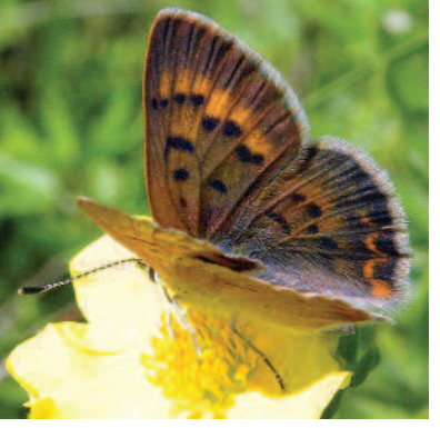
Clayton's Copper ( Lycaena dorcas claytoni), Springfield, ME, 8/2/12