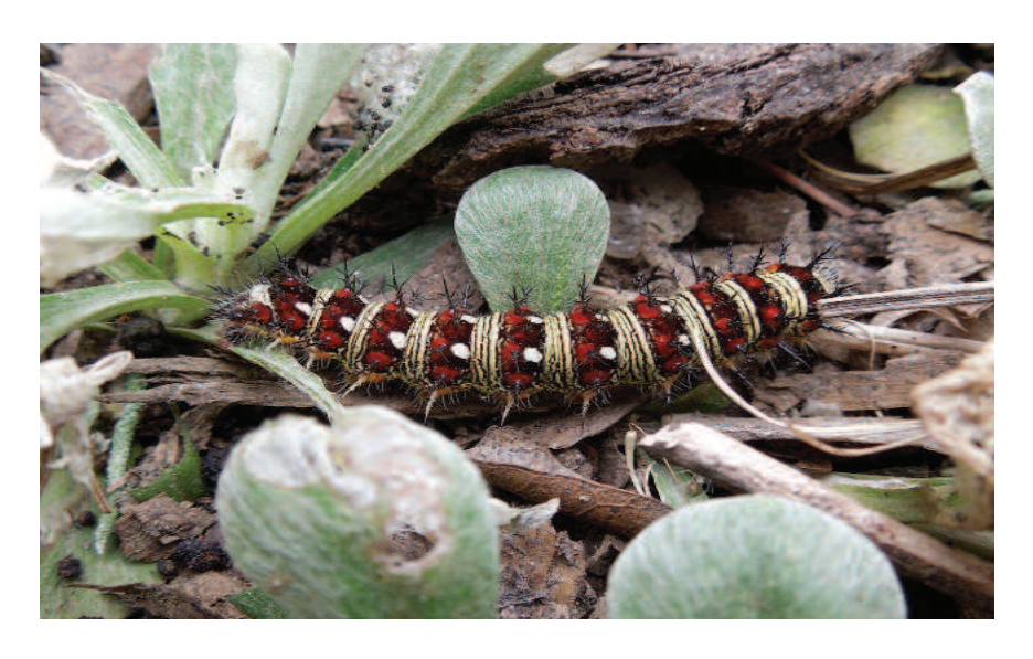
American Lady caterpillar ( Vanessa virginiensis), Whately, MA, 6/1/12