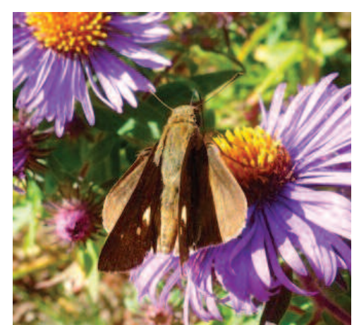
Ocola Skipper ( Panoquina ocola ), Yarmouth, MA, 10/1/12, Joe Dwelly