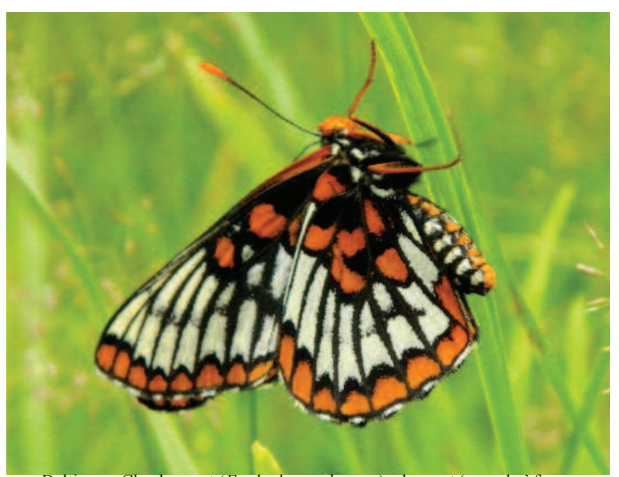
Baltimore Checkerspot ( Euphydryas phaeton), aberrant 'superba' form, West Bridgewater, MA, 6/19/12